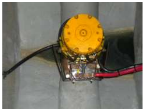
Determine source of oil near bow thruster