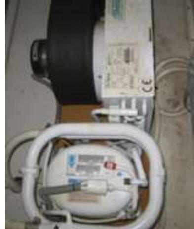
One of three CruiseAir, Heat Air units