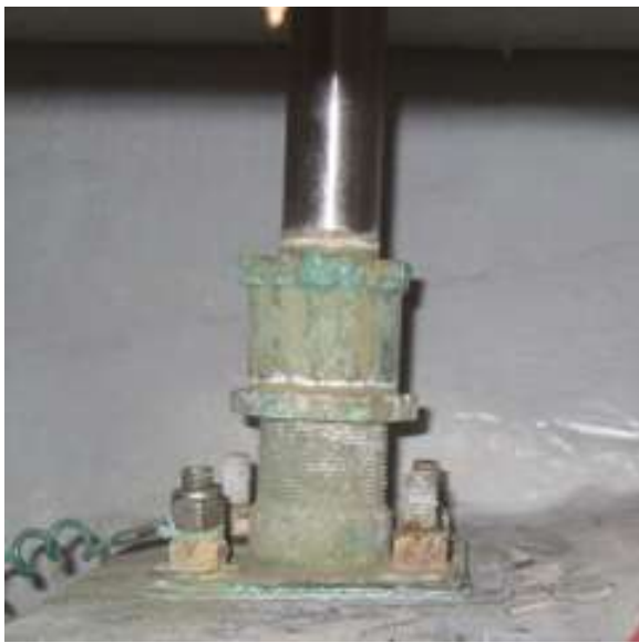
Starboard rudder shaft log is secure