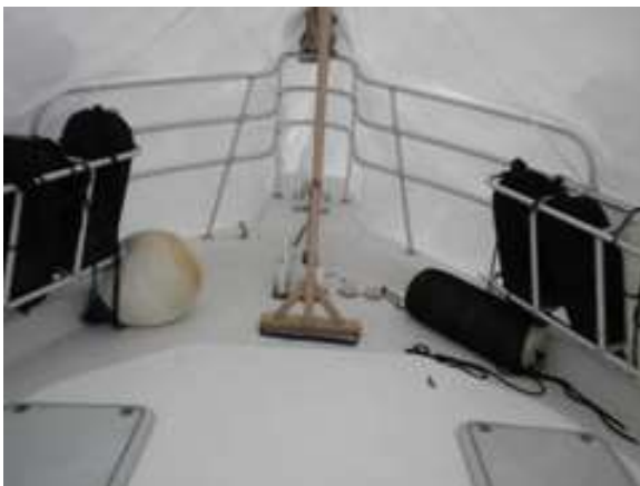
The above images show Bow Thruster, Very clean and smooth bottom finish Bronze four blade propeller, 3/8 chain rode, and fore deck and bow pulpit, all in good shape