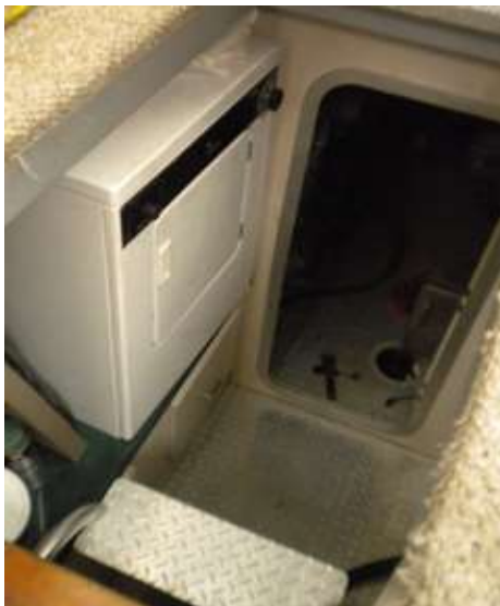
View of full size clothes dryer, a new washer is being installed