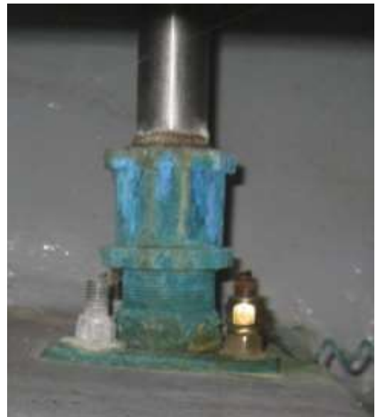
Port rudder shaft log is leaking, needs service