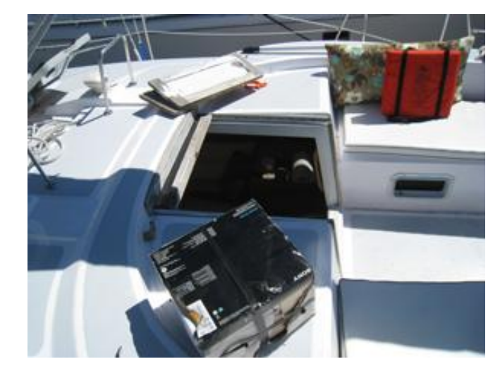
Page 3 of 10 1988 Irwin 44 Center Cockpit Sloop

The two sails on board (Main and 120 Genoa) are all upgrades and in very good condition. The dodger was not on board. The halyards are new condition. The sheets are in new condition. All of the sheets and their associated blocks are in new condition.