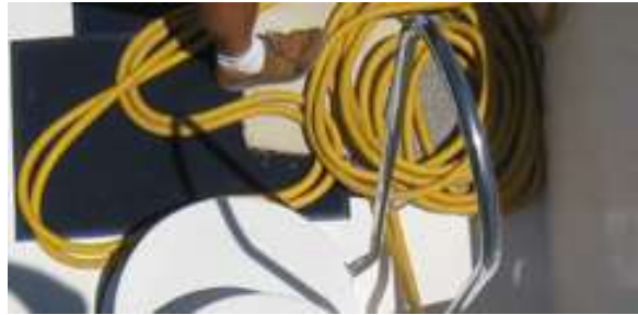
This image shows two 50 amp shore power cables that are in good condition.