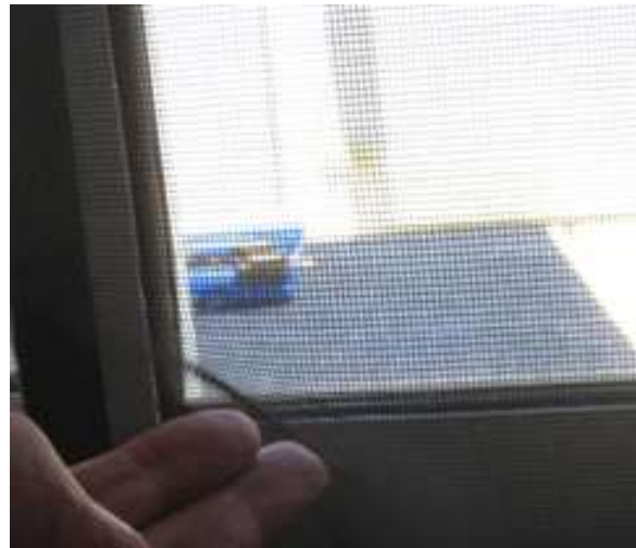
This image shows ripped screen on cockpit entry door that is in need of service.