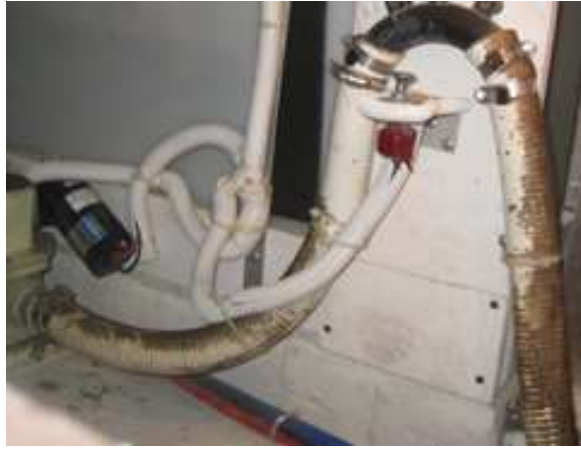
This image shows wanother septic system hose that is in need of service.