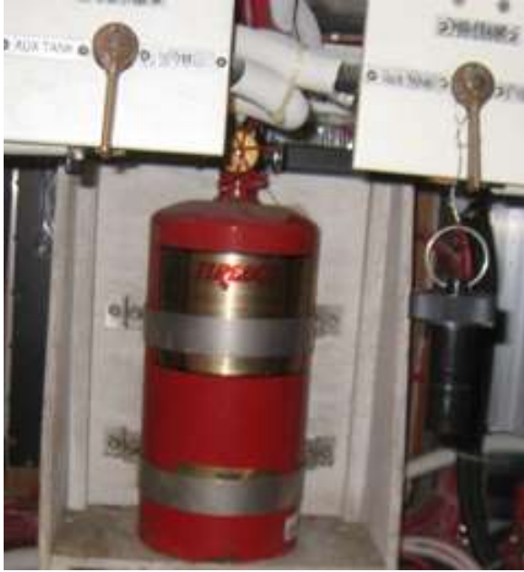
The Auto fire supression system is in need of inspection.