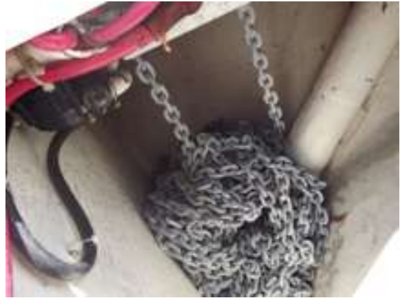
This image shows approximately 200 feet on galvanized anchor chain in the anchor locker.