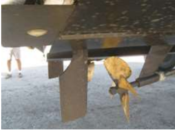
This image shows clean, propeller, strut, trim plane, and shaft.