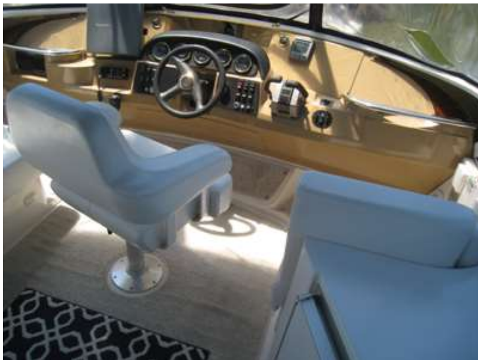
Bridge deck, Cockpit deck, and Bridge Operating Station

The operating station is well designed and the controls are easy to operate. The upholstery is in good condition overall. The compass is accurate on its present heading. The engines operating equipment, including shifts and steering are also smooth operating condition. Steering is