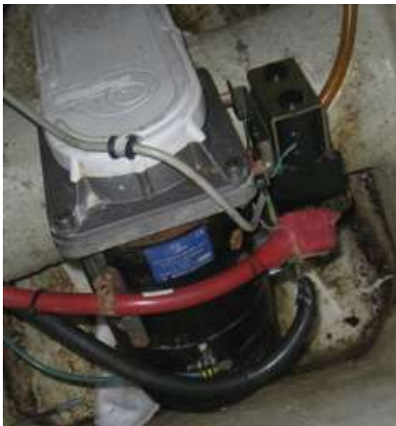
This image shows good working bow thruster.