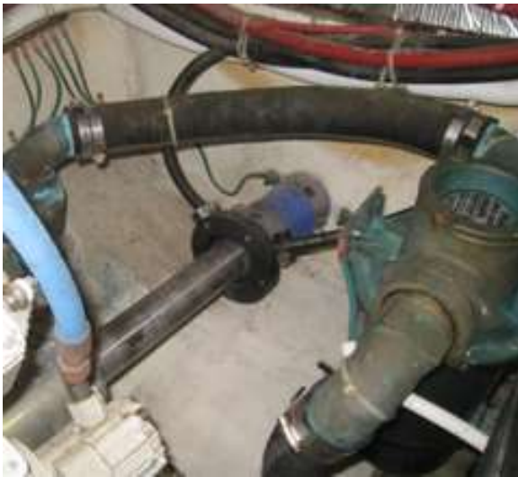
This image shows water cooled shaft log and clean bilge.